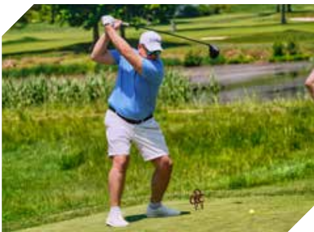
A day of steady swings, great conversations, and memorable moments on the fairway.