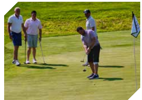
Golfers took to the greens with enthusiasm, making the most of a picture-perfect day outdoors