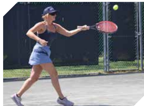
Players demonstrated skill, sportsmanship, and enthusiasm throughout the day's matches.