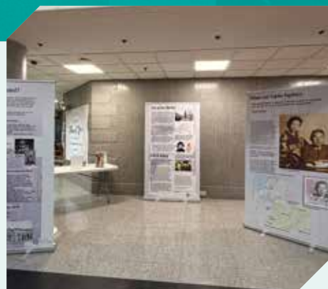
Panels throughout the hospital lobby provided a timeline of key points in the Holocaust.

On May 6, Richmond University Medical Center welcomed staff from the Wagner College Holocaust Center. A series of displays, artifacts, and presentations captured stories of the atrocities committed by the Nazis and also portrayed stories of courage and perseverance during a period of unimaginable horror and mass murder.