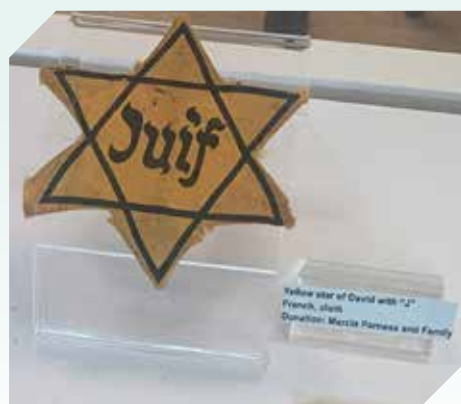
Among the artifacts on display was an actual Star of David worn by a Jewish person during the period of the Holocaust.