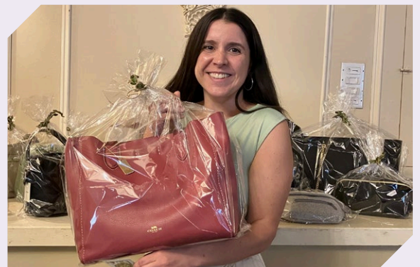
A lucky winner with her new Coach bag.