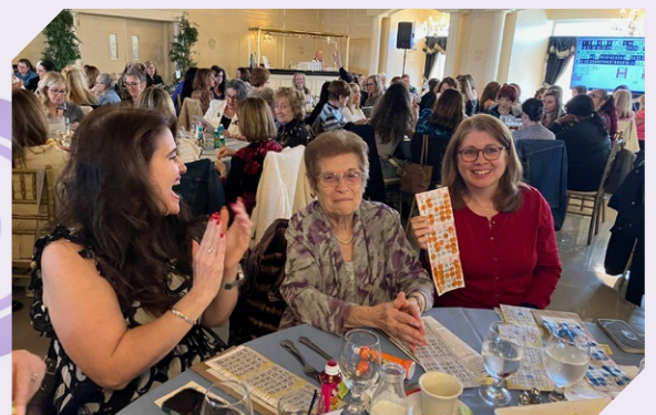
Holding up the winning numbers.