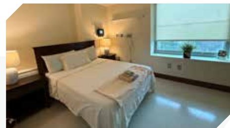
One of the four sleep center bedrooms, designed to make patients feel at home during their stay.