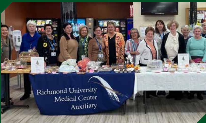
The Auxiliary held a successful bake sale on Oct. 30 inside the RUMC Cafeteria.