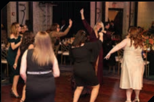
Gala partygoers dance the night away.