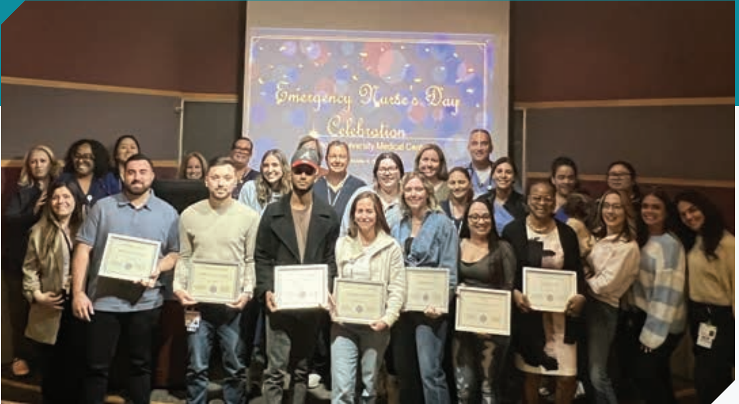
This year's Emergency Nurse Award honorees with their colleagues, families, and friends.

On October 8, Richmond University Medical Center handed out its 2024 Emergency Nurses awards. The annual ceremony recognizes emergency nurses in several categories, honoring those who demonstrated a remarkable commitment to excellence, teamwork, and patient care. The ceremony was also an opportunity to celebrate National Emergency Nurses Week, which runs from October 6 to October 12.