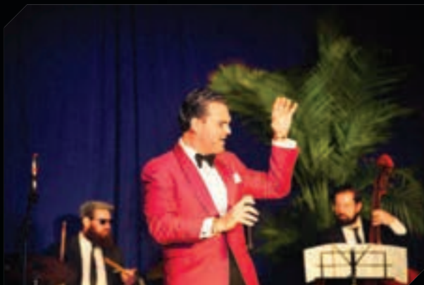
Sal "The Voice" Valentinetti, a finalist on "America's Got Talent," entertains the crowd.