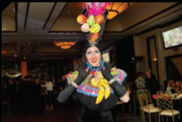
A Night at the Copa was this year's theme.