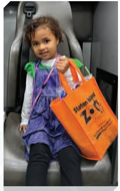
A Spooktacular attendee inside the RUMC ambulance.