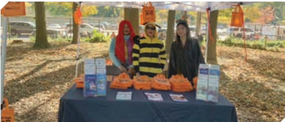
Staff from RUMC and local high schools give out trick or treat bags.

The popular event has been held at the zoo for over 26 years, with Richmond University Medical Center as the presenting sponsor for the first time this year. Several students from Wagner High School and Tottenville High School volunteered alongside staff from RUMC.