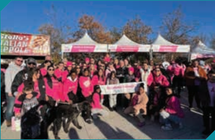
RUMC walkers gather before taking part in this year's walk, which included sections of the boardwalk in Midland Beach.