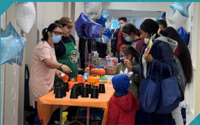
Kids attending the Community Day had a chance to play games and win prizes courtesy of RUMC's pediatrics department.