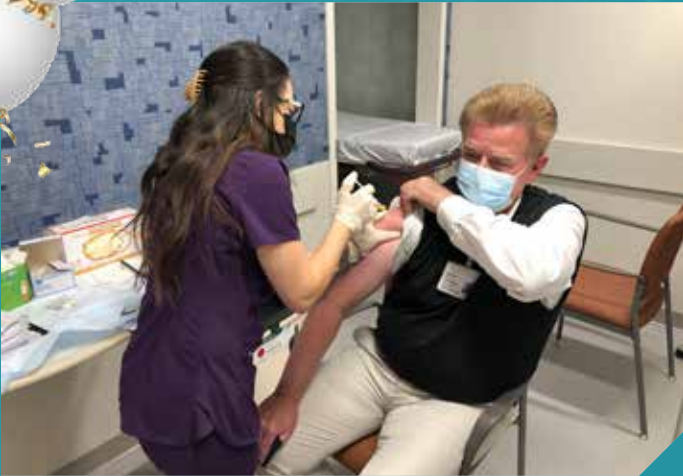
Nearly 40 people used the Community Day as an opportunity to get their COVID-19 booster.