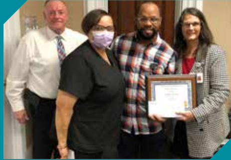
Junior Tyndale Environmental Services