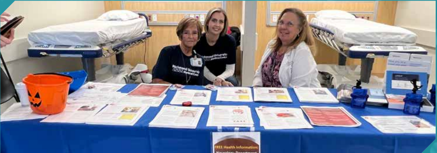
Over a dozen departments provided information on their services, including RUMC's stroke care team.