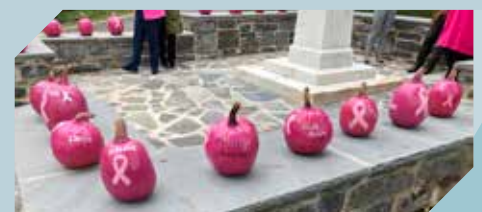
Each pumpkin features a pink ribbon, the symbol of breast cancer awareness, and the name of a breast cancer patient, survivor, or someone lost to the disease.