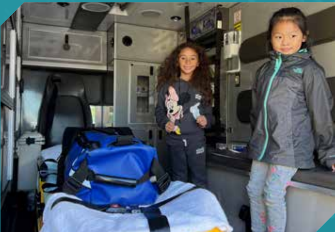
Kids had an opportunity to tour the inside of a RUMC ambulance.