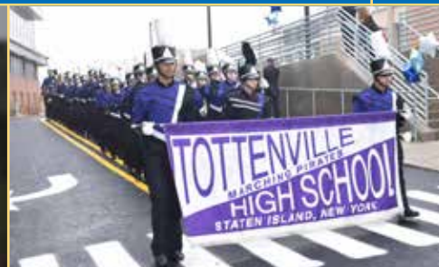
The Tottenville High School marching band performed as part of the ceremony.