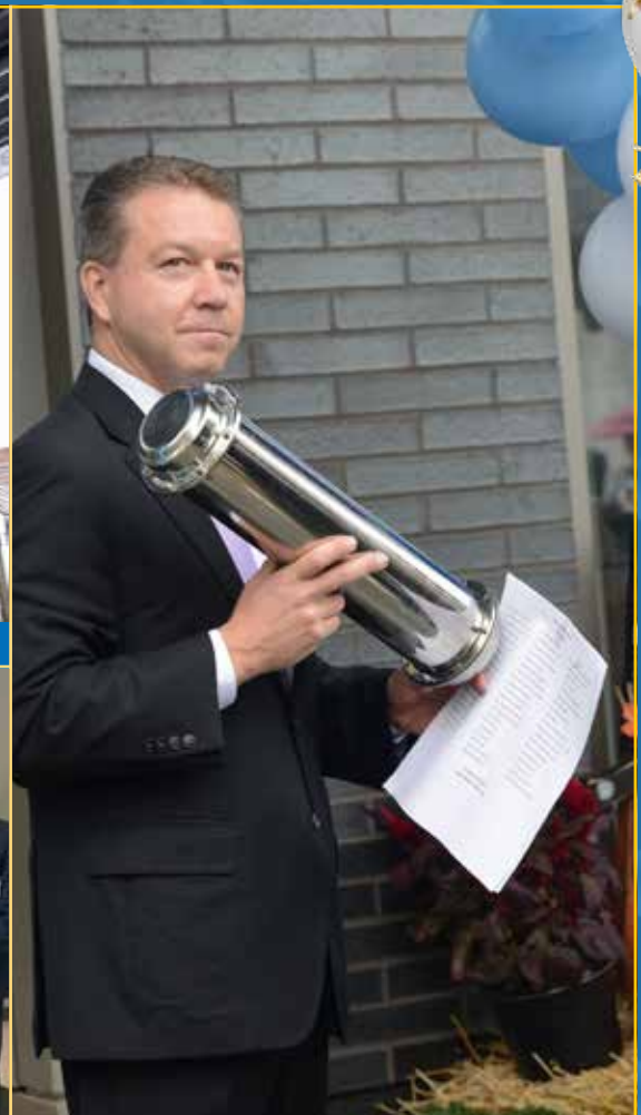
A time capsule was unveiled during the ceremony. The capsule will contain items from the opening of the ED, will be buried nearby and unearthed in 50 years.