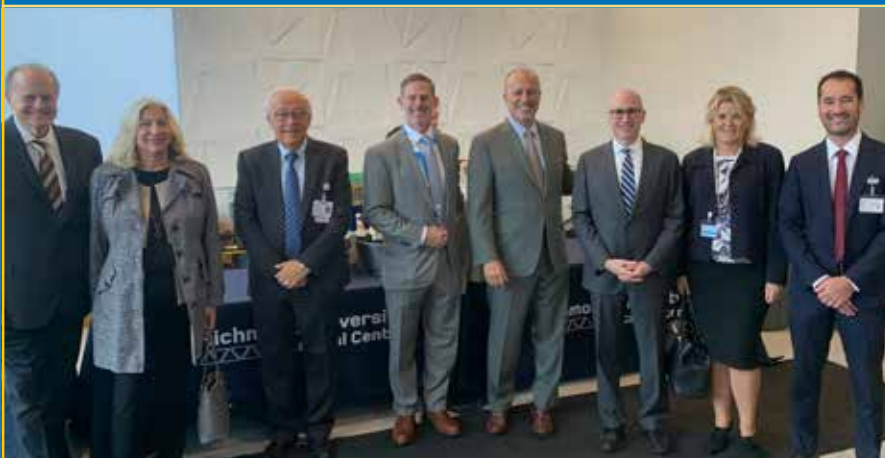
RUMC leadership and trustees with leadership from Mount Sinai Health System.